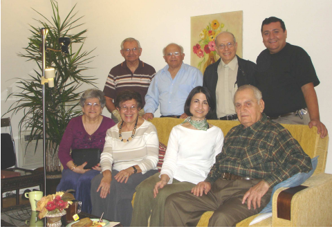
Attendees of the Regional Bible Study

The group is meeting every second and third Thursdays of the month in two geographical regions. The first group members are coming from Montebello, Whittier and Fullerton areas and the second group's members are coming from Covina, Arcadia, Pasadena and Glendale.